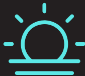
Abundant Natural Light