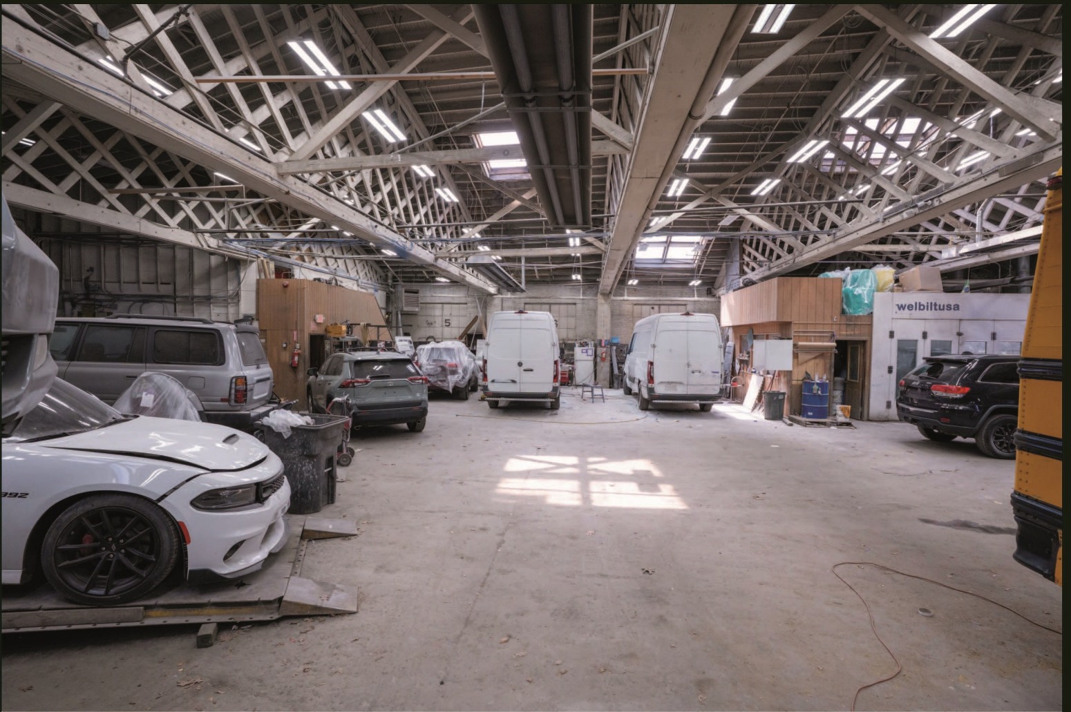
10,158 SF building plus 7261 SF fenced lot