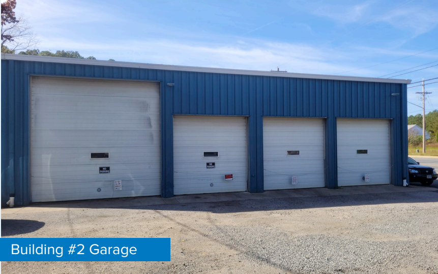
Building #2 Garage