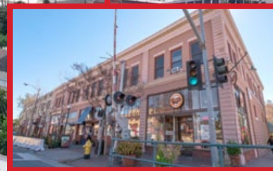
DOWNTOWN SO. PAS.