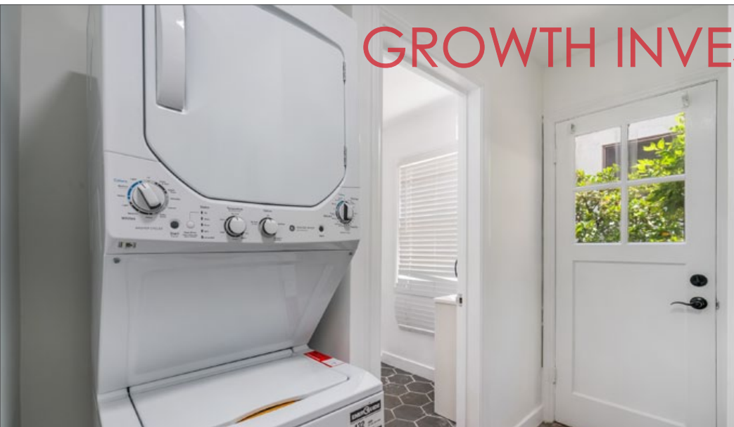
Upgraded unit has laundry hookups and laundry machine