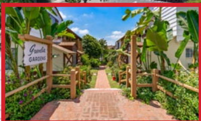
1745 GREVELIA ST