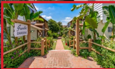
1745 GREVELIA ST