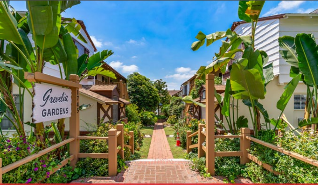
BEAUTIFULLY LANDSCAPED COMMUNITY