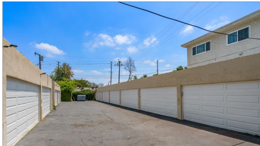
GARAGE PARKING, NO SHARED DRIVEWAY