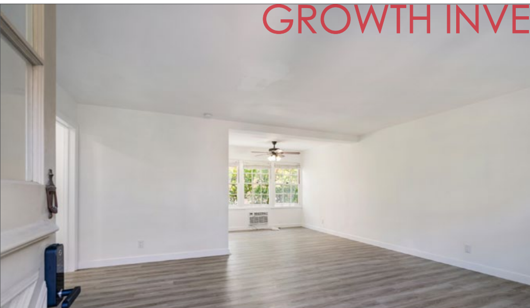
EXTRA LARGE and SPACIOUS 1BED unit