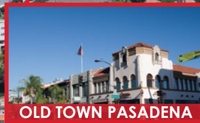
OLD TOWN PASADENA