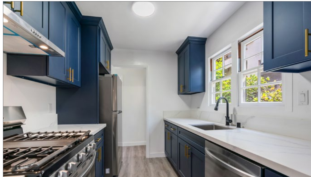
TASTEFULLY UPGRADED with High-End Finishes