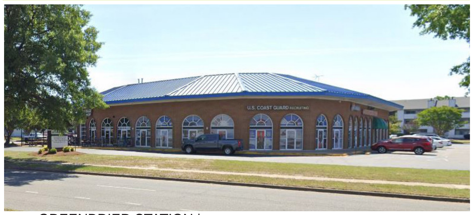
GREENBRIER STATION | 1011 Eden Way North, Condo #3 (Suites G-L), Chesapeake, VA