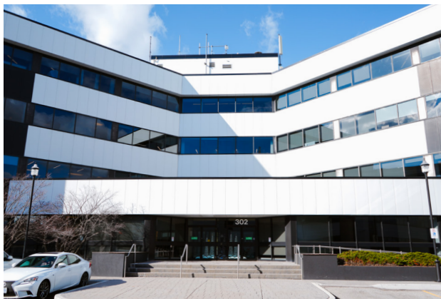
302 Town Centre Boulevard