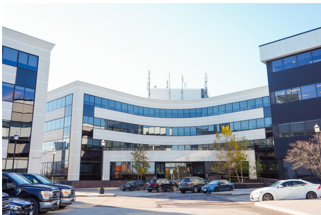
300 Town Centre Boulevard