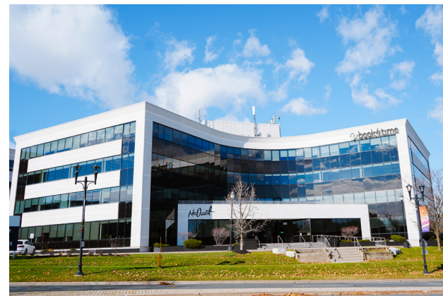
306 Town Centre Boulevard