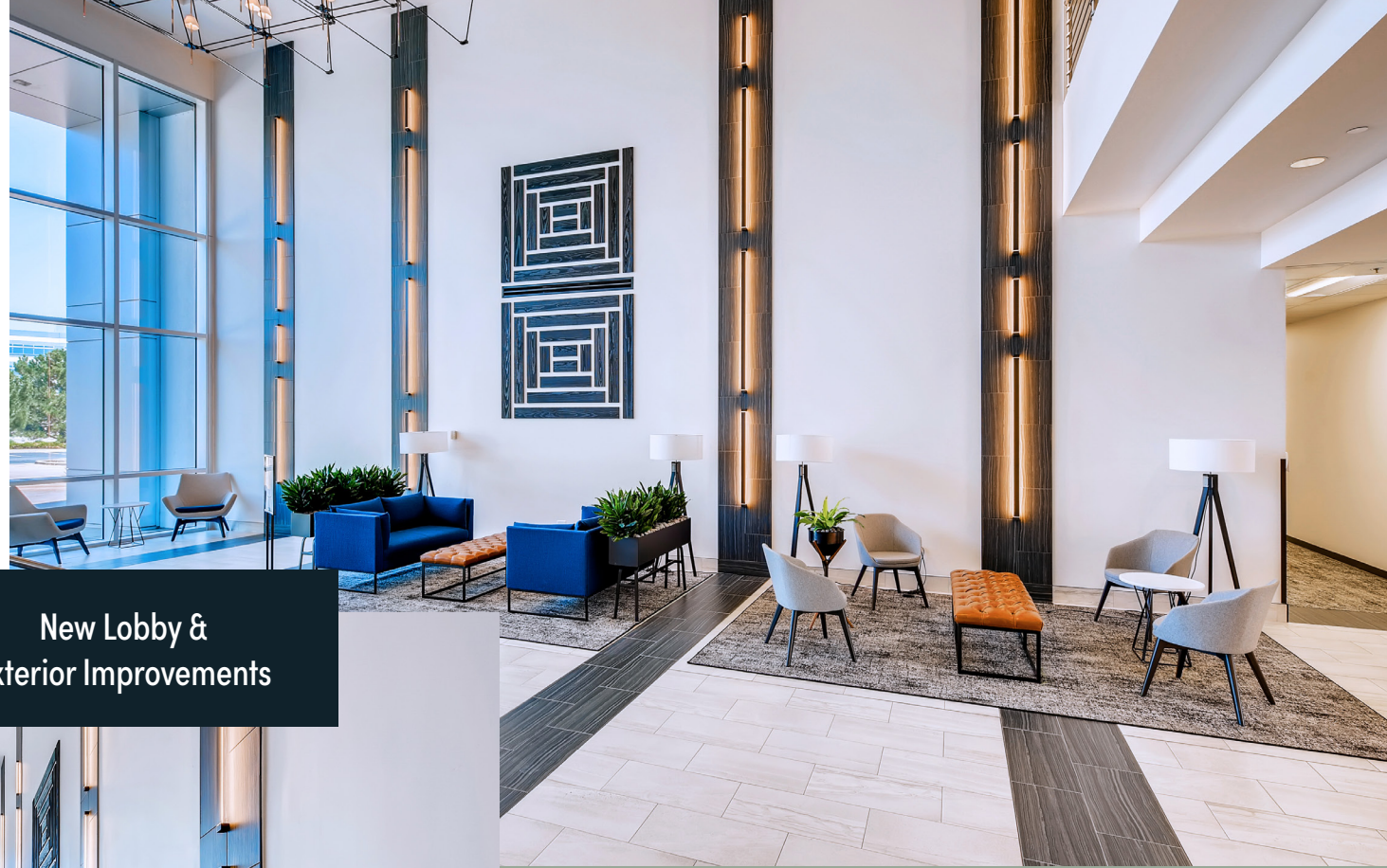
New Lobby & Exterior Improvements