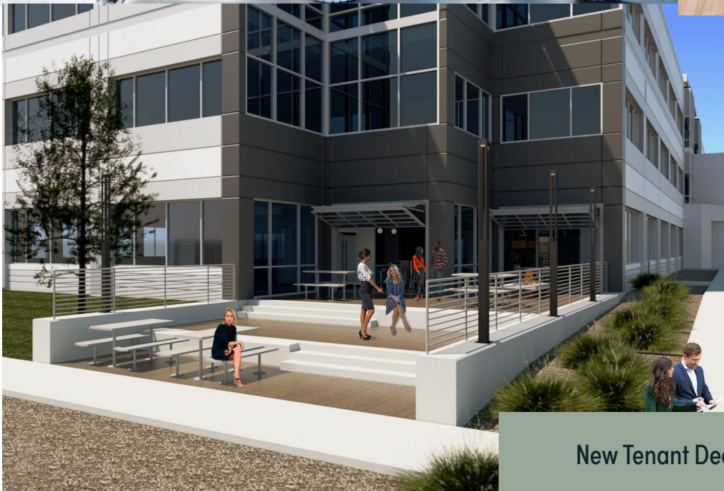
New Tenant Deck