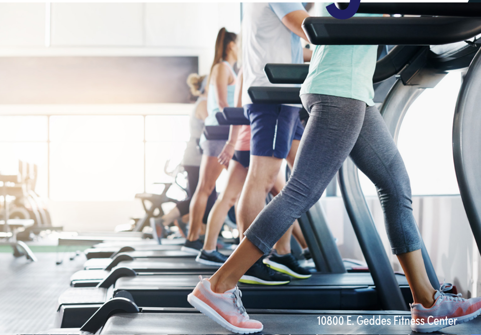
10800 E. Geddes Fitness Center