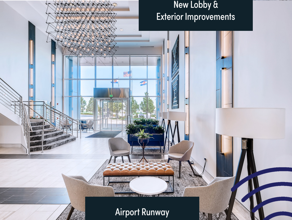
Airport Runway & Mountain Views