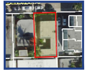
AERIAL PHOTOGRAPH (NOT-TO-SCALE)