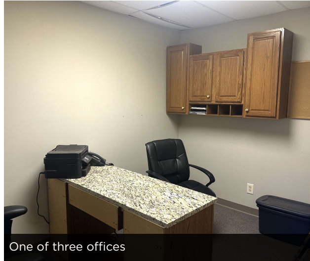
One of three offices