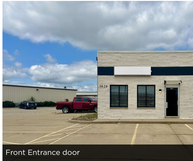
Front Entrance door