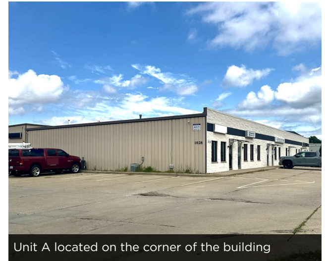
Unit A located on the corner of the building