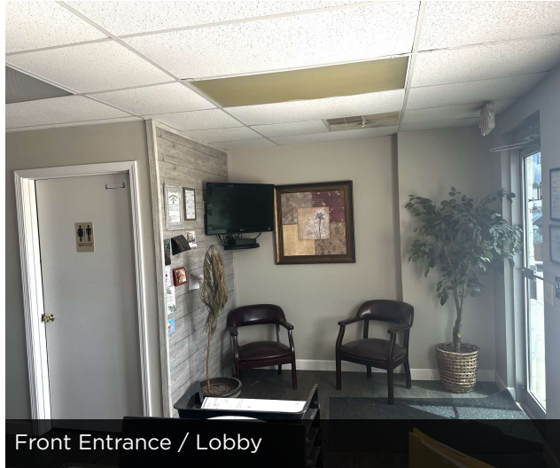
Front Entrance / Lobby