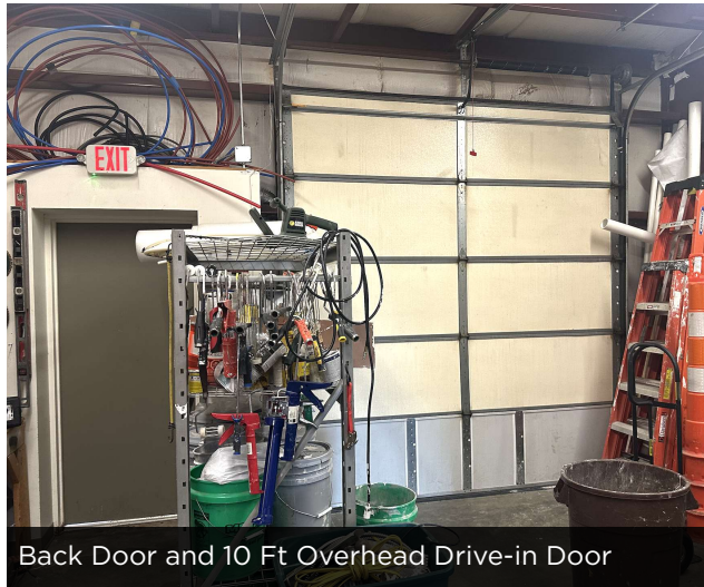
Back Door and 10 Ft Overhead Drive-in Door