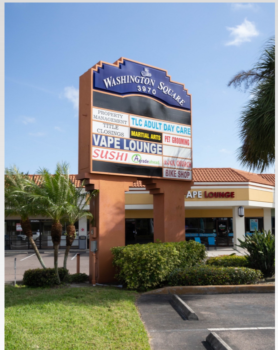
PYLON SIGNAGE ON SR 580