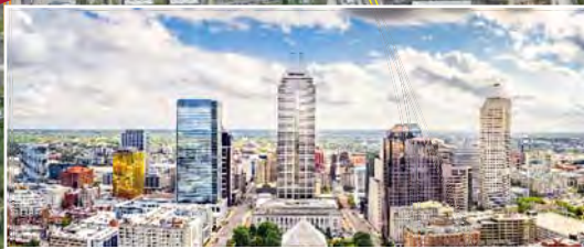
Downtown Indianapolis 5 Miles