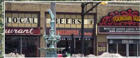
Fountain Square 3.3 Miles