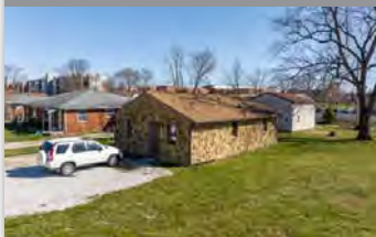
1141 Standish Ave, Indianapolis, IN

851 SF 2 Beds, 1 Bath Occupancy - Leased 2024 - 2025 - Leased 2025 - 2026