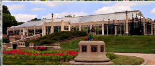
Garfield Park 2.5 Miles