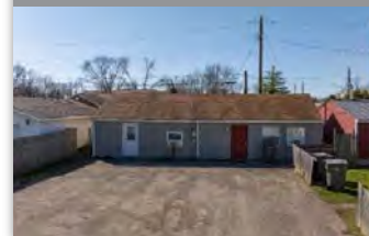
3704 Aurora St, Indianapolis, IN

920 SF 2 Beds, 1 Bath Occupancy - Leased 2024 - 2025 - Leased 2025 - 2026