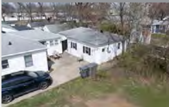
3819 S State Ave, Indianapolis, IN

920 SF 2 Beds, 1 Bath Occupancy - Leased 2024 - 2025 - Leased 2025 - 2026