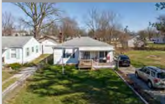
3817 S. State Ave, Indianapolis, IN

1,001 SF 3 Beds, 1 1/2 Bath Occupancy - Leased 2024 - 2025 - Leased 2025 - 2026