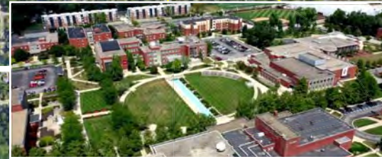
University of Indianapolis Blocks Away