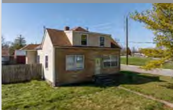
3702 Aurora St, Indianapolis, IN

2,016 SF 5 Beds, 2 Baths Occupancy - Leased 2024 - 2025 - Leased 2025 - 2026