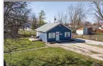
3732 Asbury St, Indianapolis, IN

552 SF 1 Bed, 1 Bath Occupancy - Leased 2024 - 2025 - Leased 2025 - 2026