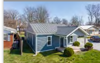
3933 S Walcott St, Indianapolis, IN

1,050 SF 3 Beds, 1 Bath Occupancy - Leased 2024 - 2025 - Leased 2025 - 2026