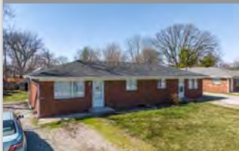
3946 S Walcott St, Indianapolis, IN (Duplex)

1,674 SF 4 Beds, 2 Baths Occupancy - Leased 2024 - 2025 - Leased 2025 - 2026