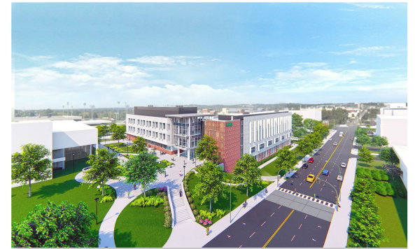
UAB Current Renovations