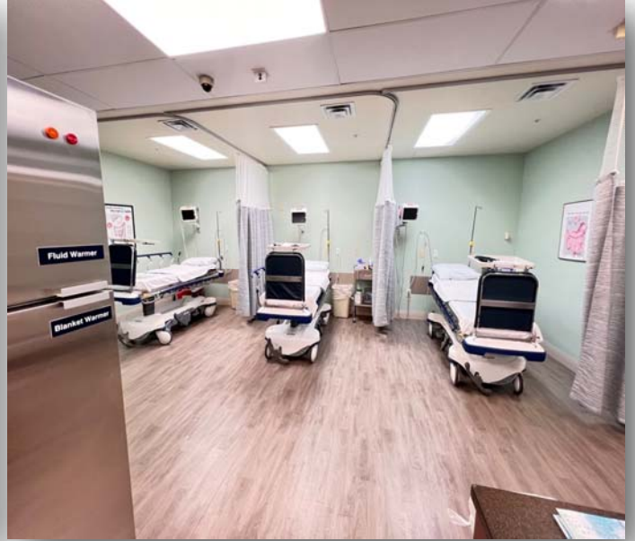
Prep & Recovery Room