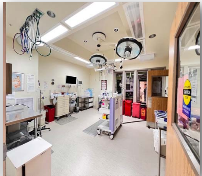
Operating Room 2