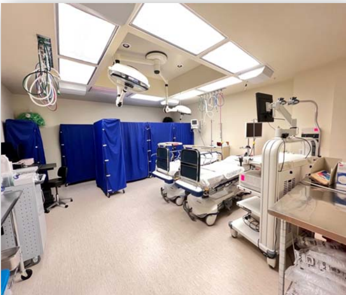
Operating Room 1