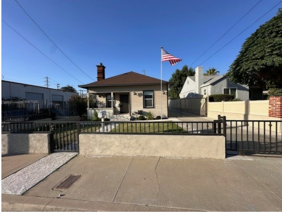
519 E Stuart Ave, Redlands, CA 92374 - Office