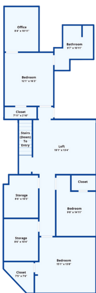
First Floor Floor Plan

For more information, feel free to reach out. 864-466-2206 | Jennafleming@kw.com