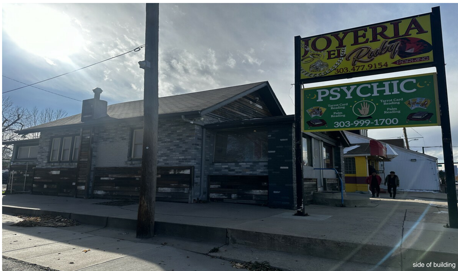
side of building