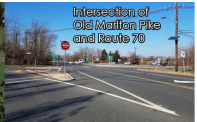
Intersection of Old Marlton Pike and Route 70