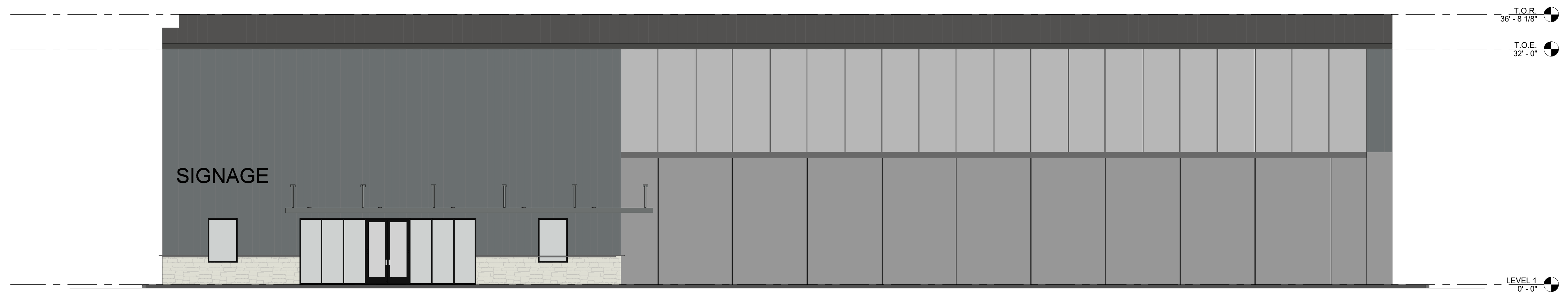
WEST ELEVATION - CONCEPT 1 1/8" = 1'-0"