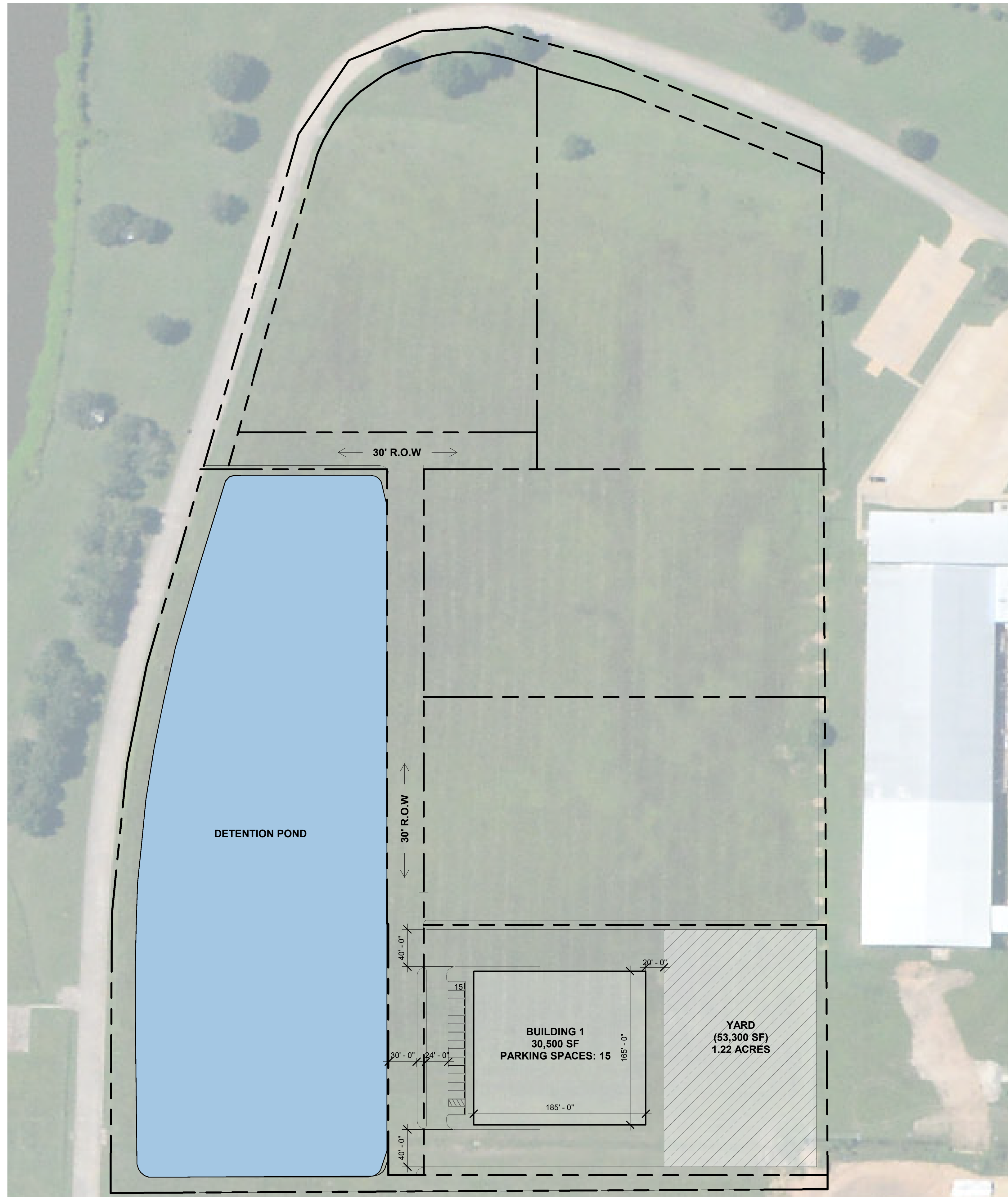
MASTER PLAN - PHASE 1 1/64" = 1'-0"