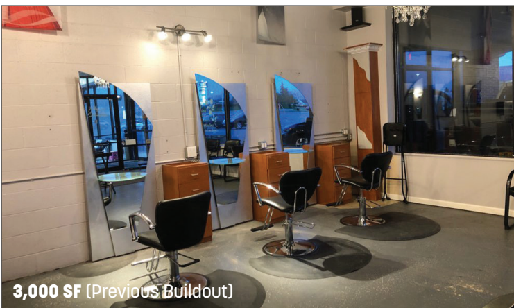
3,000 SF (Previous Buildout)