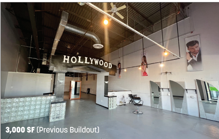
3,000 SF (Previous Buildout)