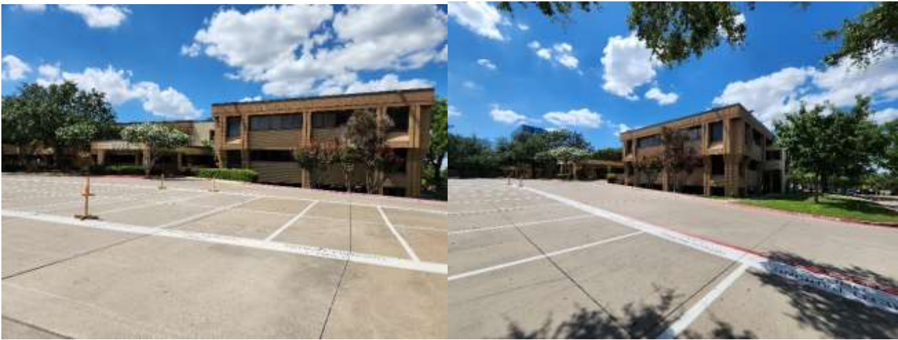
Exterior View of the Medical Building with Front and Rear Parking