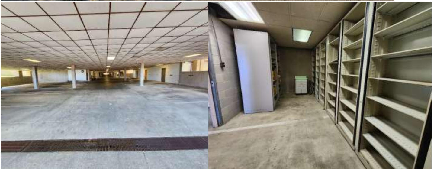
Dedicated Underground Parking with Storage Space for the Subject Suite