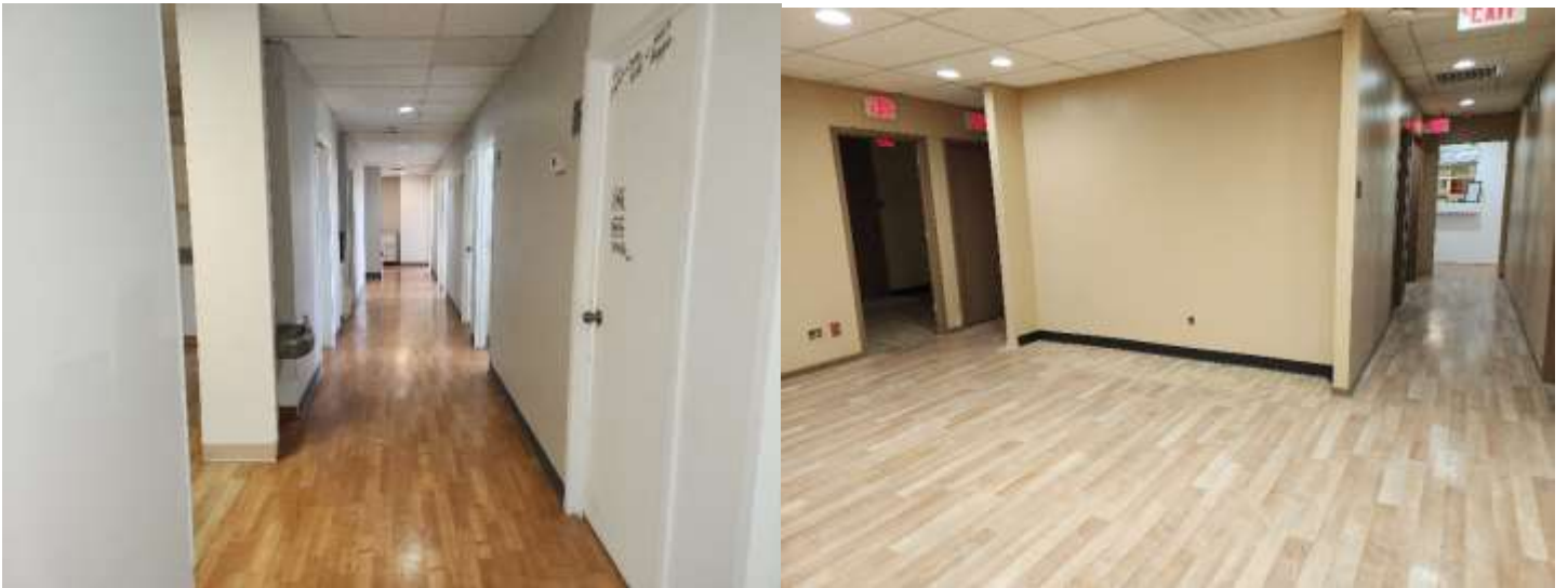
Tenants in place: Chiropractor, Occupational Therapist and Medical Office Supplies