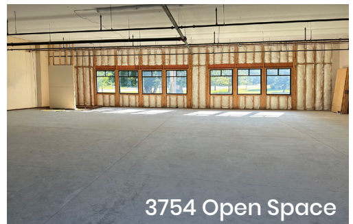
3754 Open Space