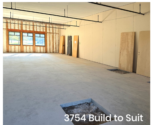
3754 Build to Suit