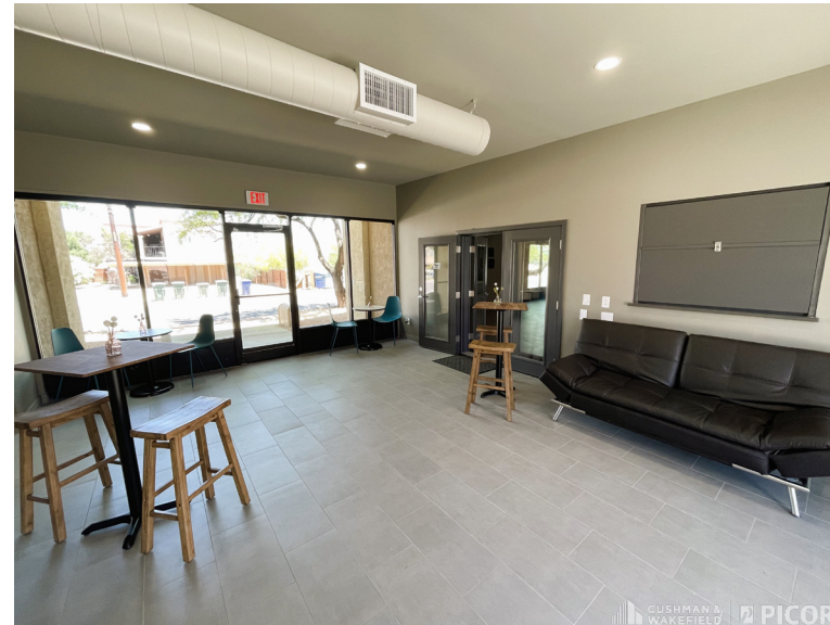
Ground Floor Property Photos