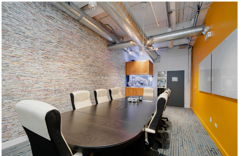
CONFERENCE ROOM ONE