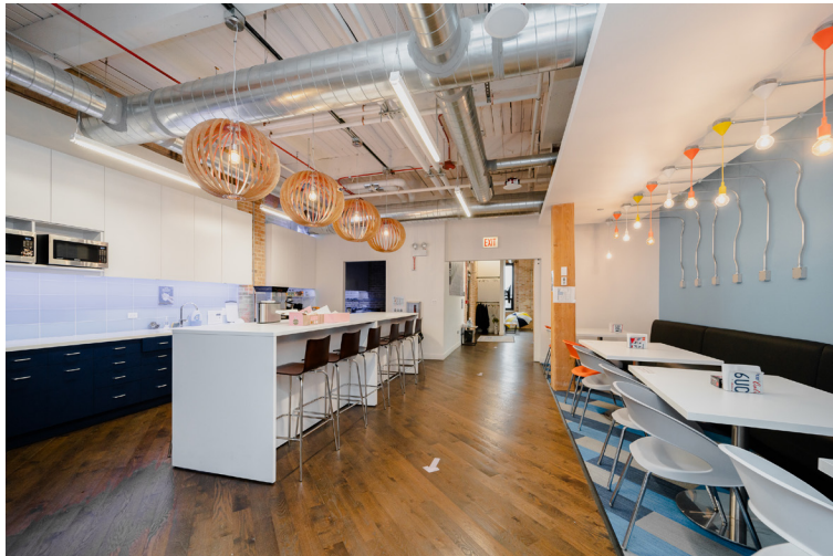
BREAK ROOM / KITCHEN