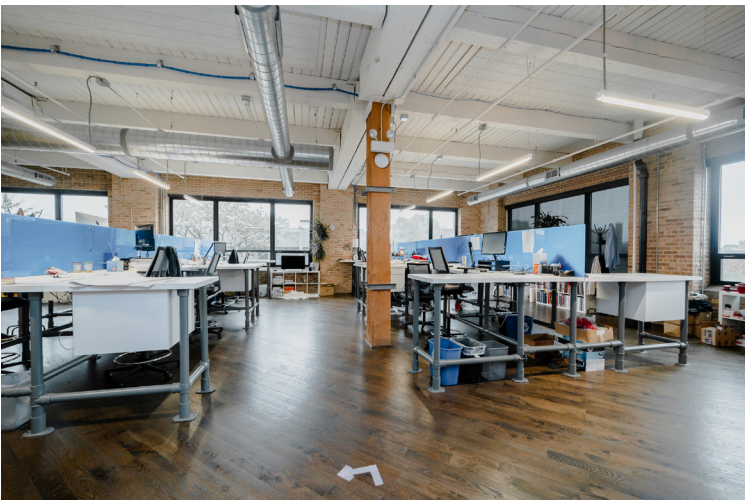
OPEN WORK AREA ONE