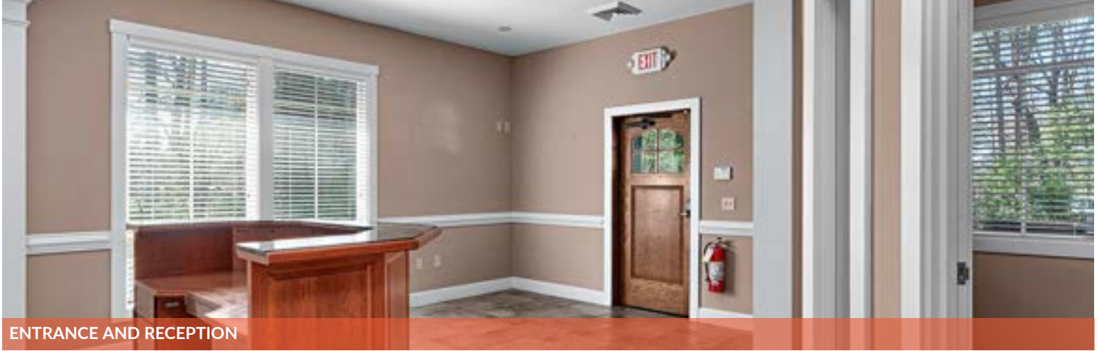
ENTRANCE AND RECEPTION

1075 Hendersonville Road, Asheville, NC 28801