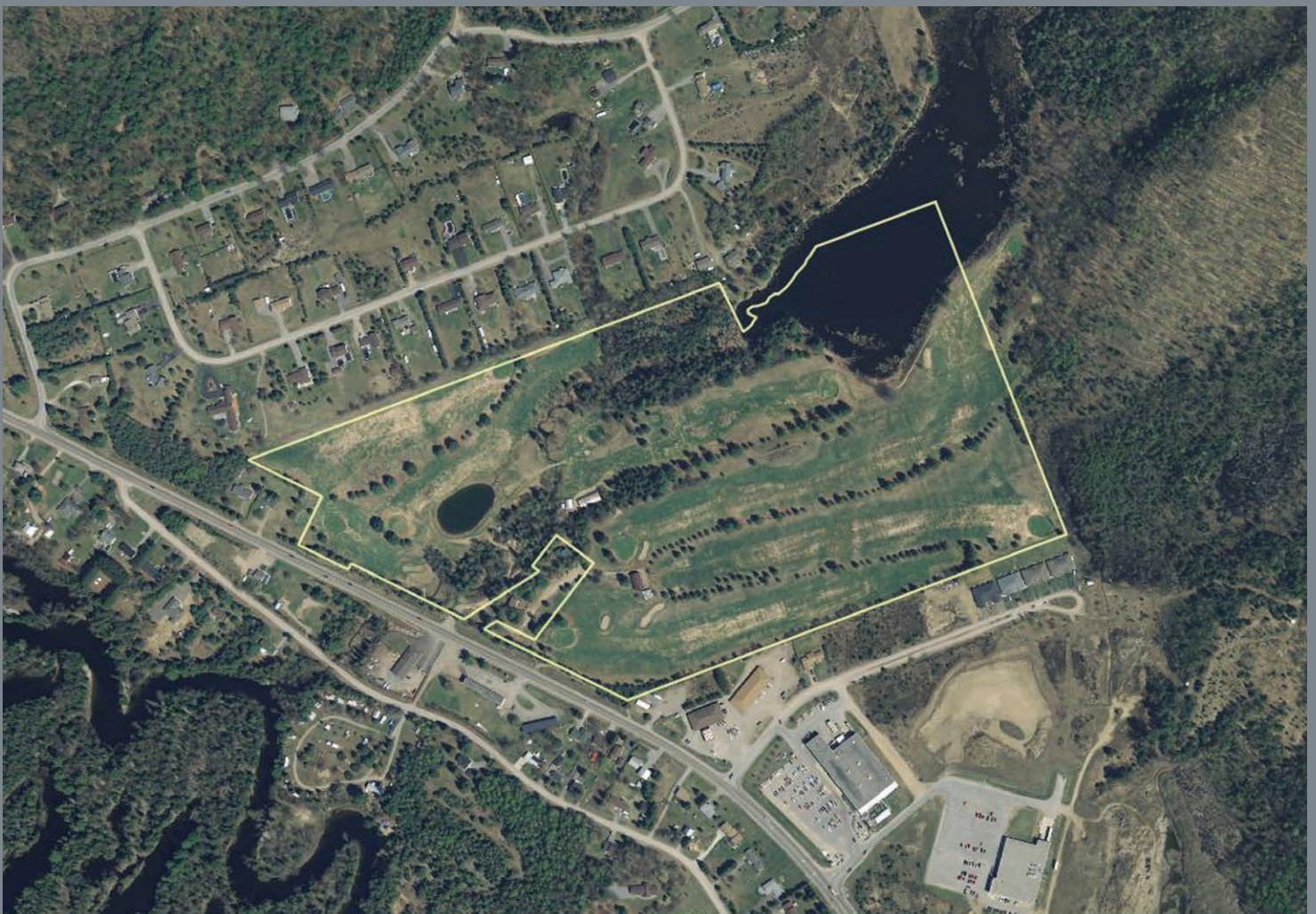
Photo Date: 2013. NOT A PLAN OF SURVEY. Boundary may not line up with aerial photo.

BANCROFT | 545 Hastings St. North - Ontario