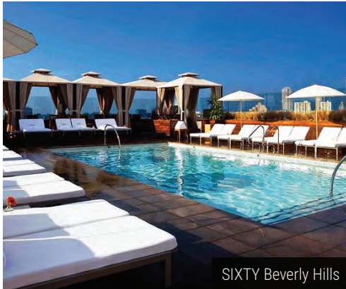
SIXTY Beverly Hills