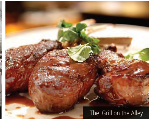
The Grill on the Alley