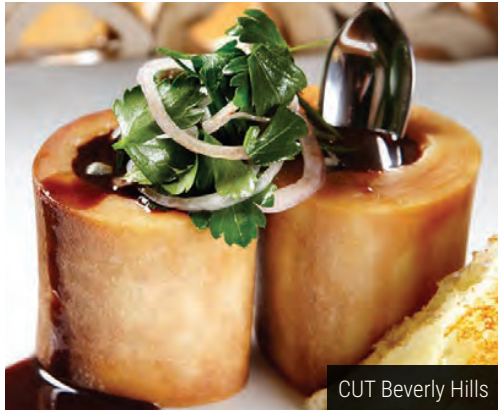
CUT Beverly Hills