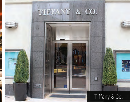
Tiffany & Co.