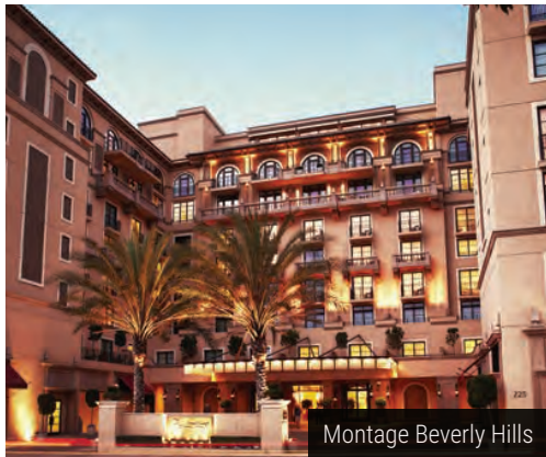
Montage Beverly Hills