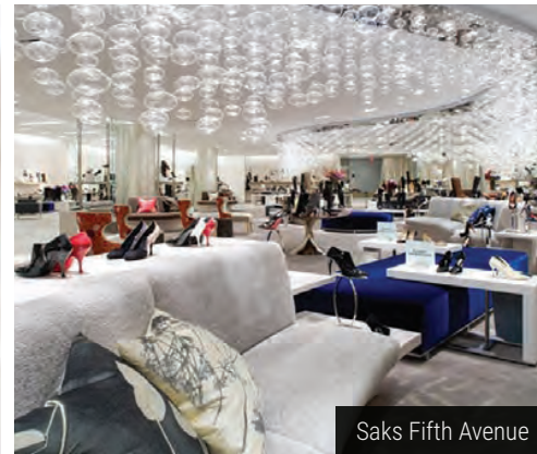
Saks Fifth Avenue