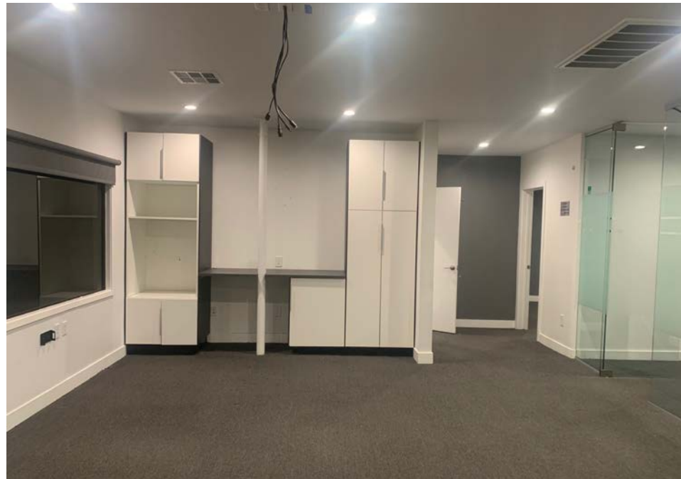
2ND FLOOR OFFICE PHOTOS