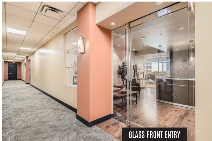
GLASS FRONT ENTRY