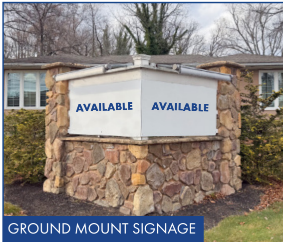
GROUND MOUNT SIGNAGE