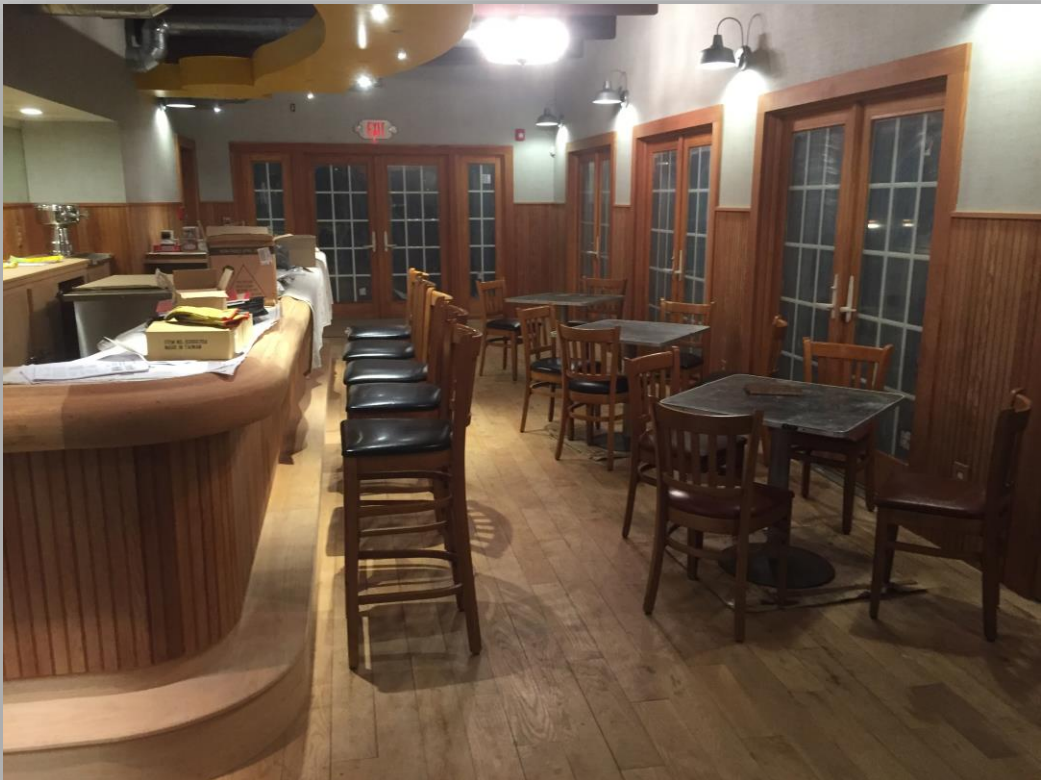
All information is subject to errors, omissions, modification, and withdrawal. Information is from sources deemed to be reliable but should not be relied upon without independent verification.