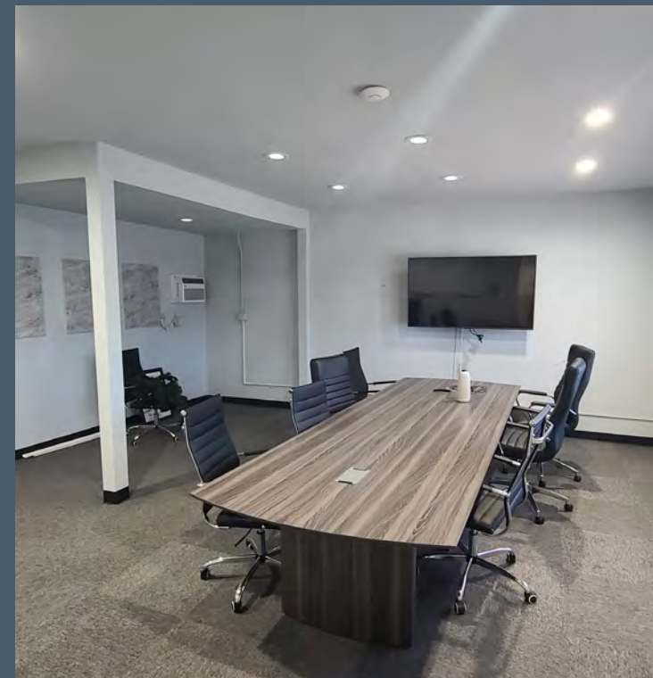
2430 CYPRESS WAY | FULLERTON, CALIFORNIA