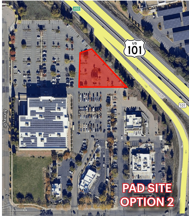
PAD SITE OPTION 2