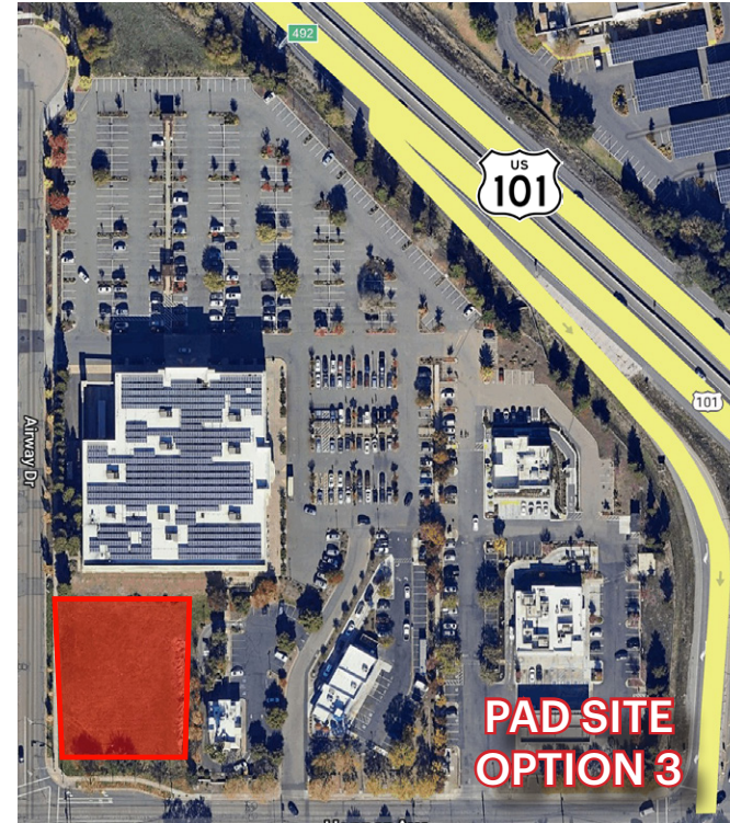
PAD SITE OPTION 3