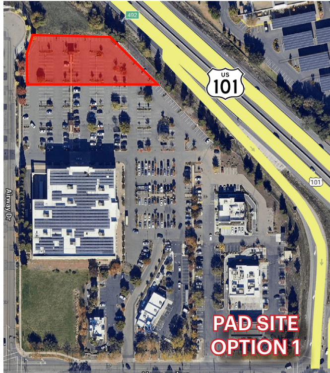
PAD SITE OPTION 1