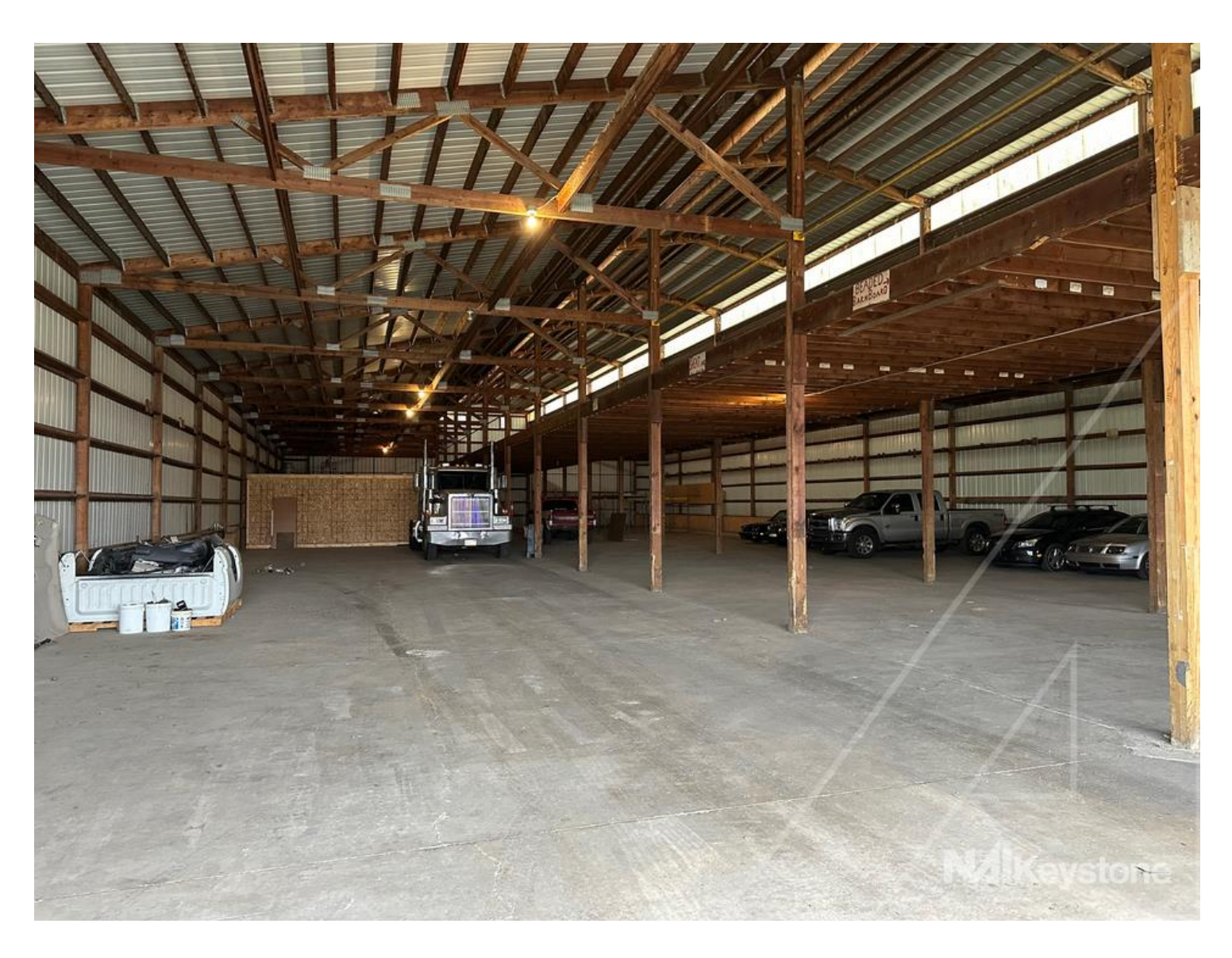
Smooth Concrete Floor Mezzanine Access