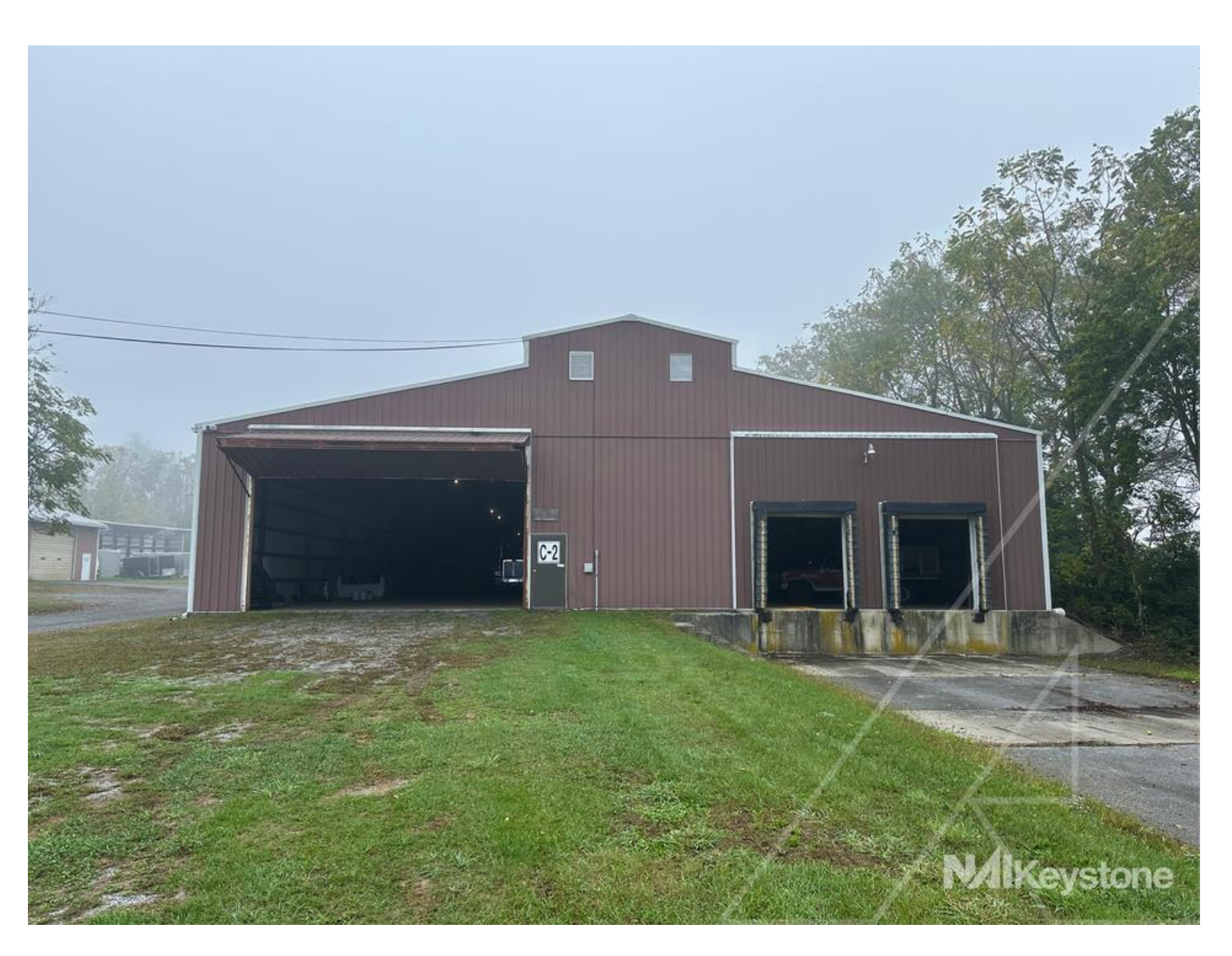
Two 24' Cantilever At-Grade Doors and Two Truck Docks