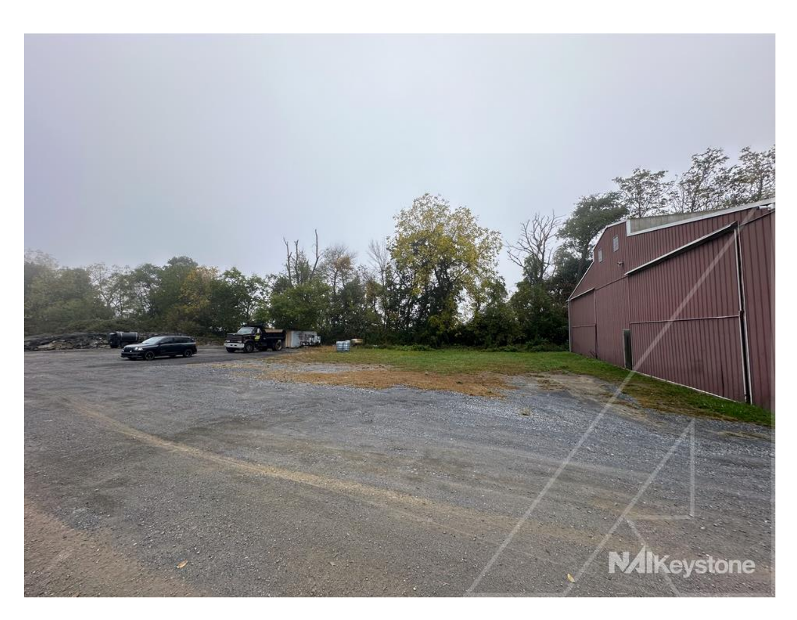
Parking Area Around The Building