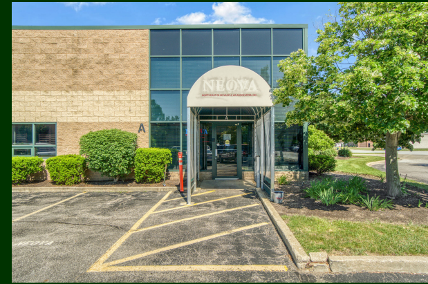
36445 Biltmore Place, Unit A, Willoughby, OH 44094

No warranty or representation, express or implied, is made as to the accuracy of the information contained herein. It is submitted subject to errors, omissions, price changes, rental or other conditions, withdrawal without notice, and to any special listing conditions imposed by our client.