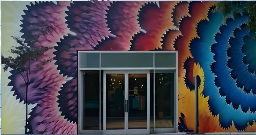
Storefront in Progress