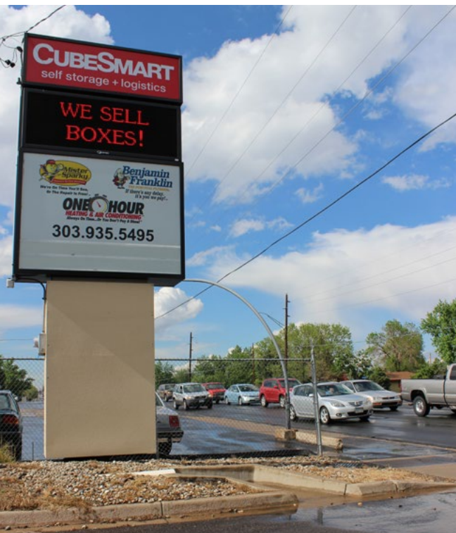
±49,000 AVERAGE TRAFFIC COUNT