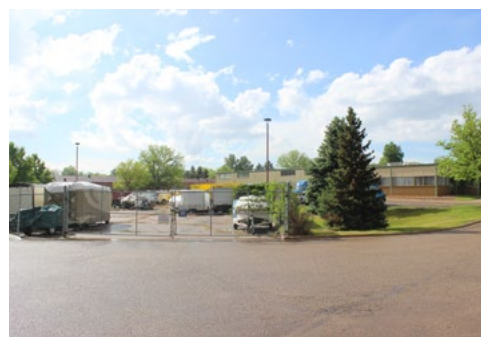
SECURED FENCED/GATED YARD