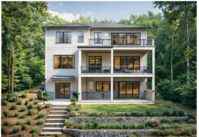
Rear Walkout Perspective