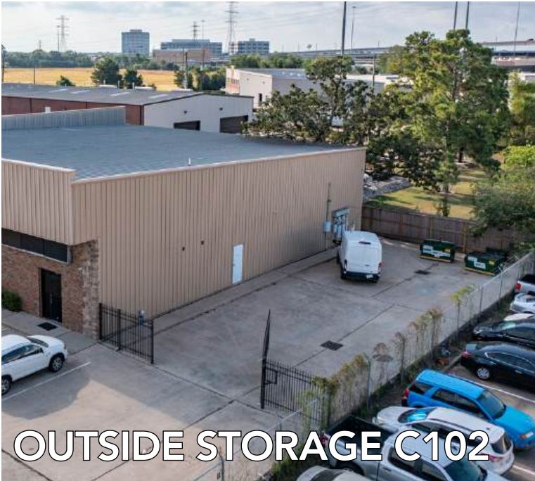
OUTSIDE STORAGE C102