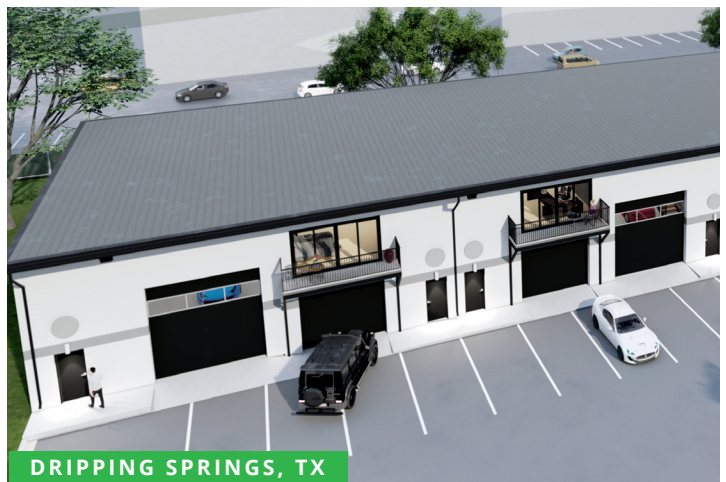
DRIPPING SPRINGS, TX