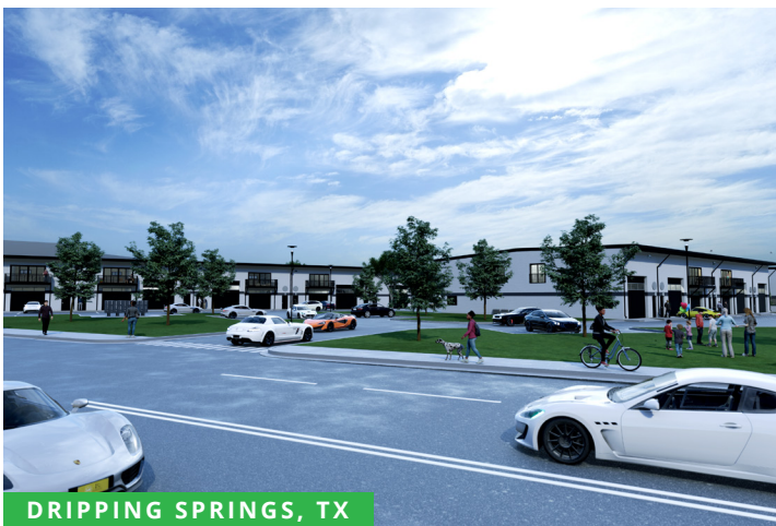
DRIPPING SPRINGS, TX