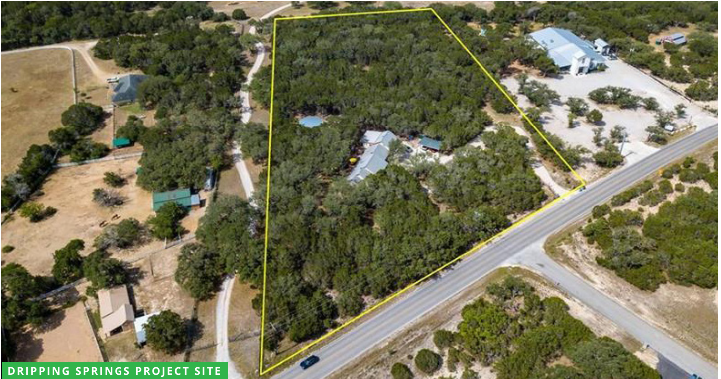
DRIPPING SPRINGS PROJECT SITE