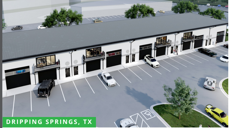
DRIPPING SPRINGS, TX

Price: TBD Reserve Now to Secure Preferred Pricing & Location