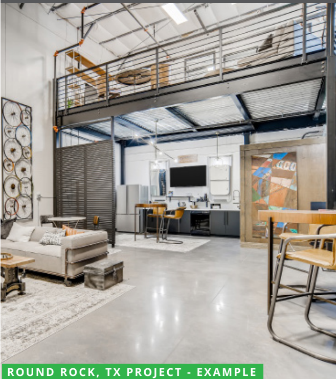
ROUND ROCK, TX PROJECT - EXAMPLE