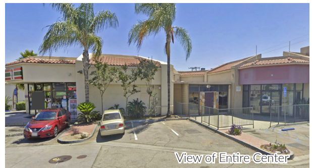
View of Entire Center

JAIMIE MARCHAND jmarchand@kennedywilson.com DRE #01904001