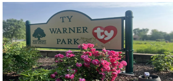
Ty Warner Park: