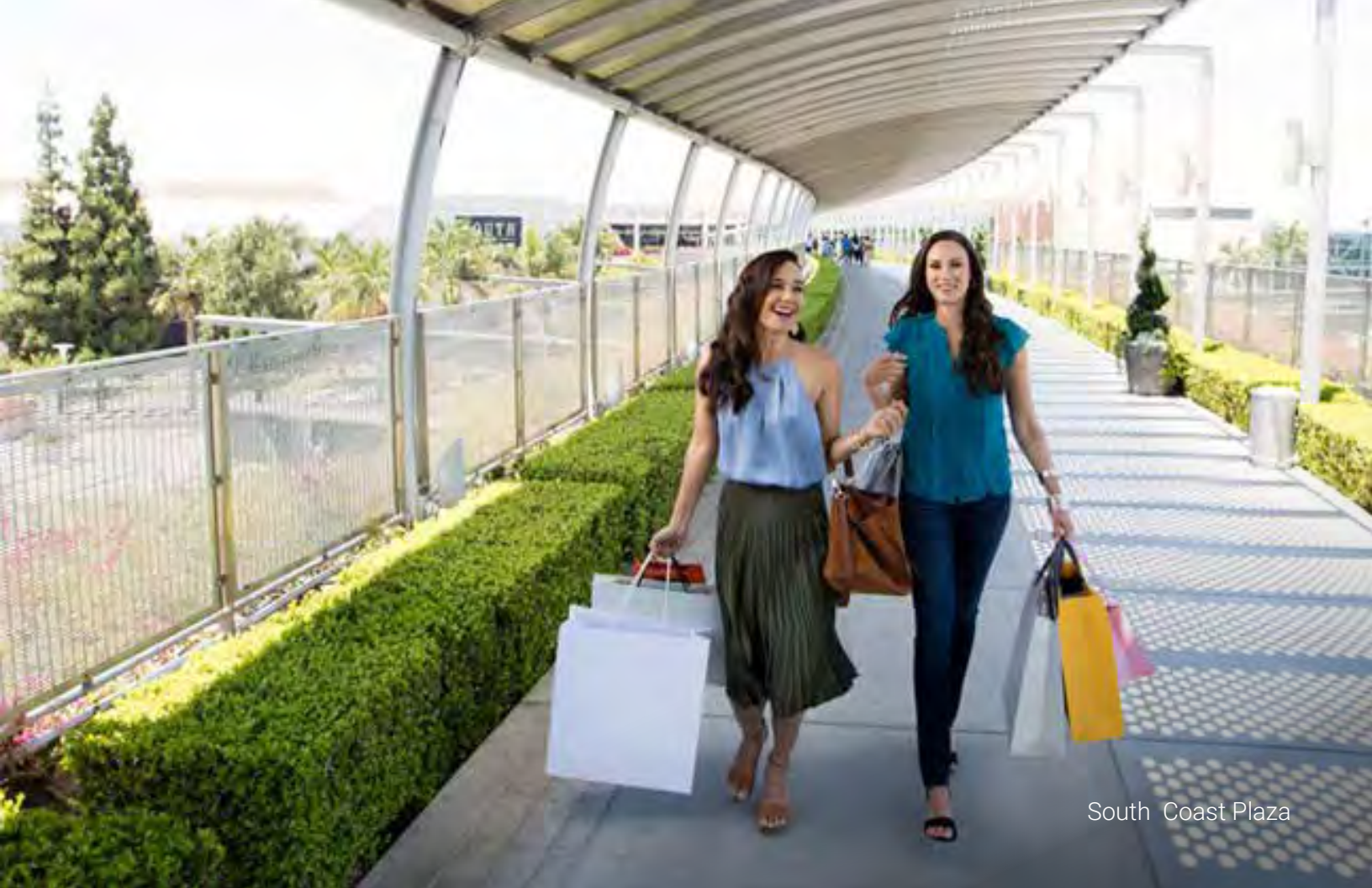
South Coast Plaza