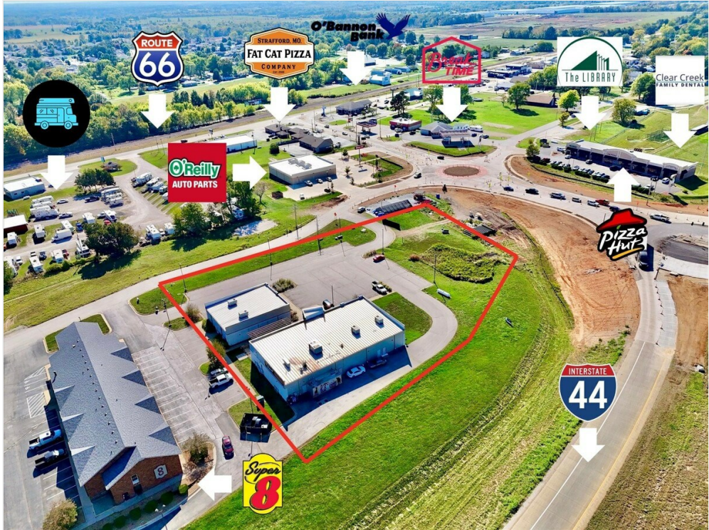
Untitled design (6)