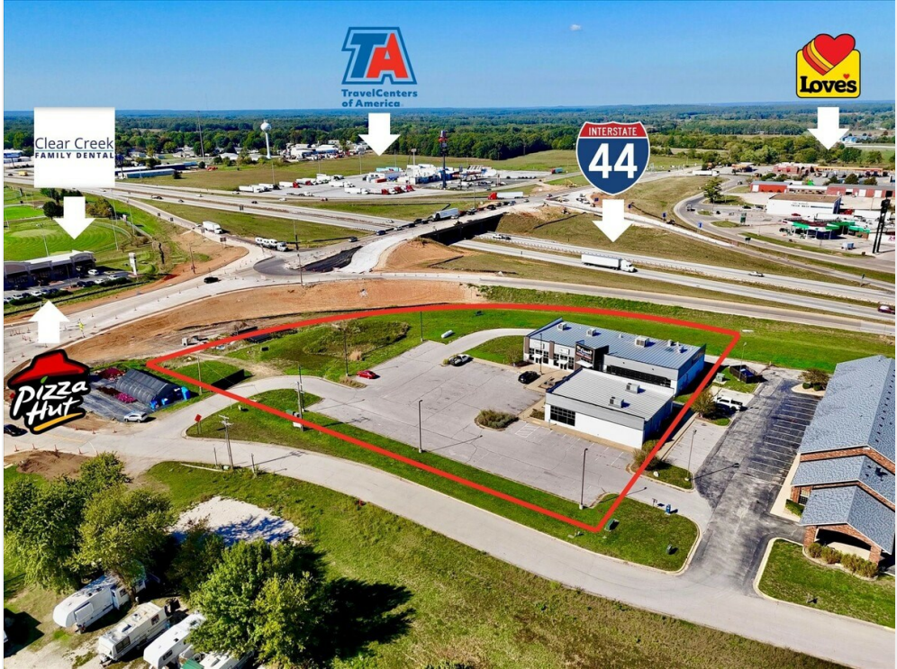
Untitled design (4)