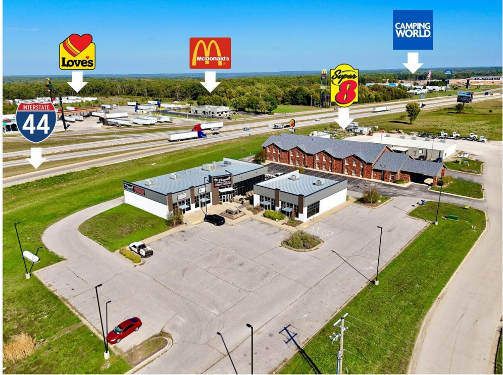
Untitled design (3)