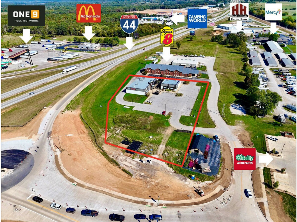
Untitled design (7)