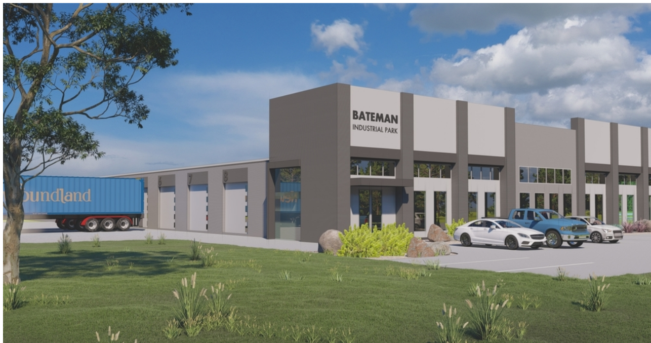
Conceptual Building Option