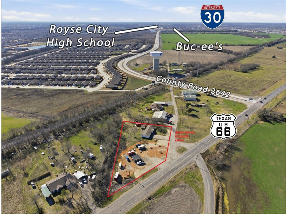
Approx. Prop Lines