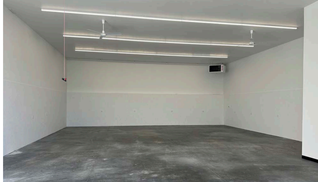
FLEXIBLE WAREHOUSE SPACE