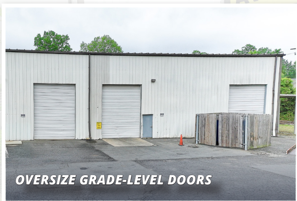
OVERSIZE GRADE-LEVEL DOORS