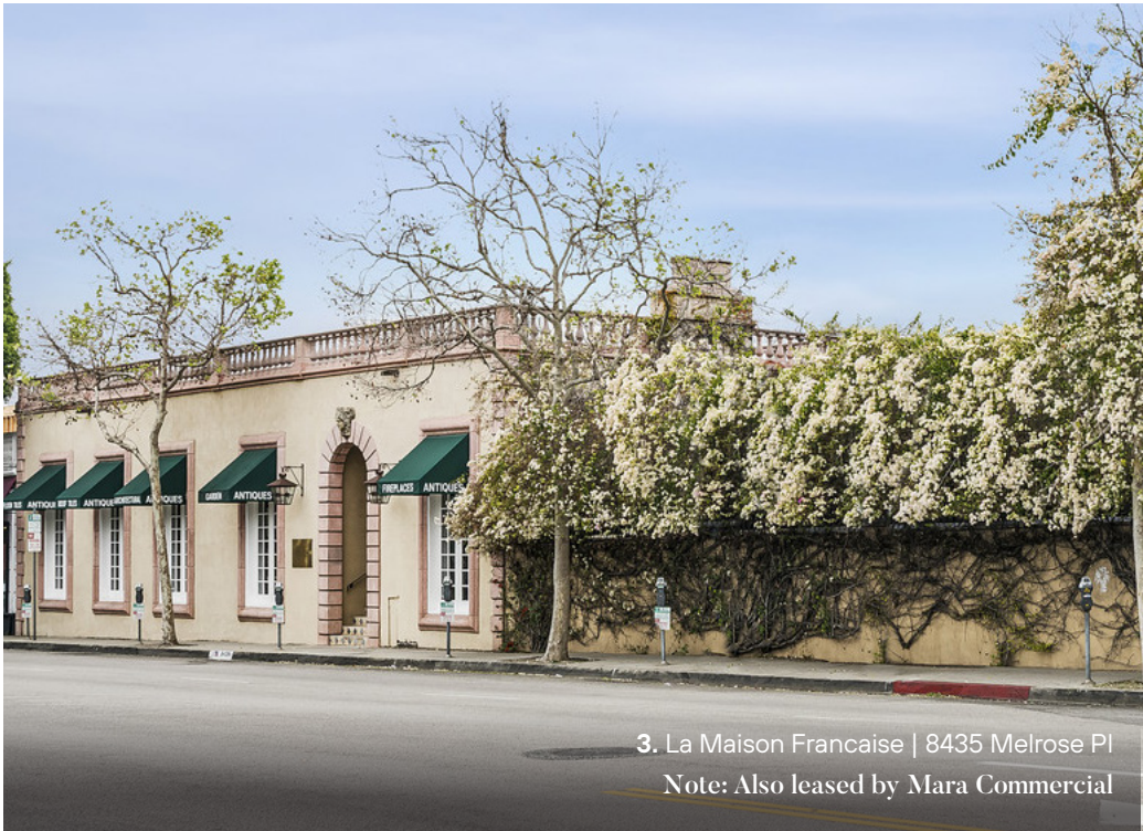
3. La Maison Francaise | 8435 Melrose Pl Note: Also leased by Mara Commercial