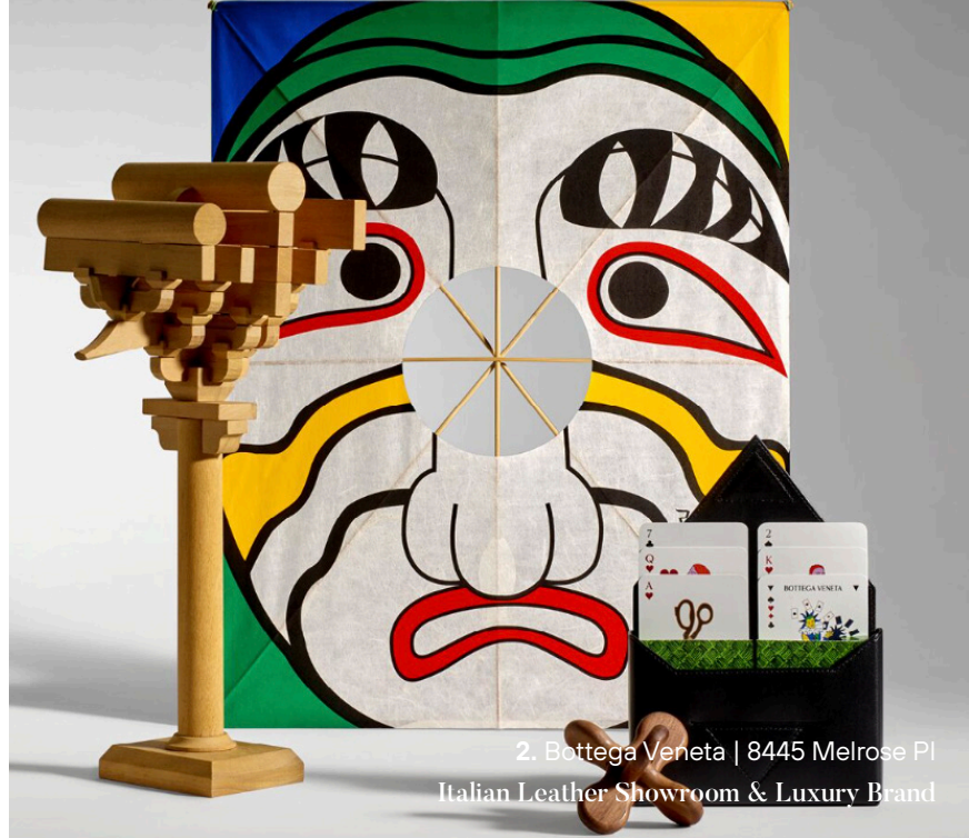
2. Bottega Veneta | 8445 Melrose Pl Italian Leather Showroom & Luxury Brand