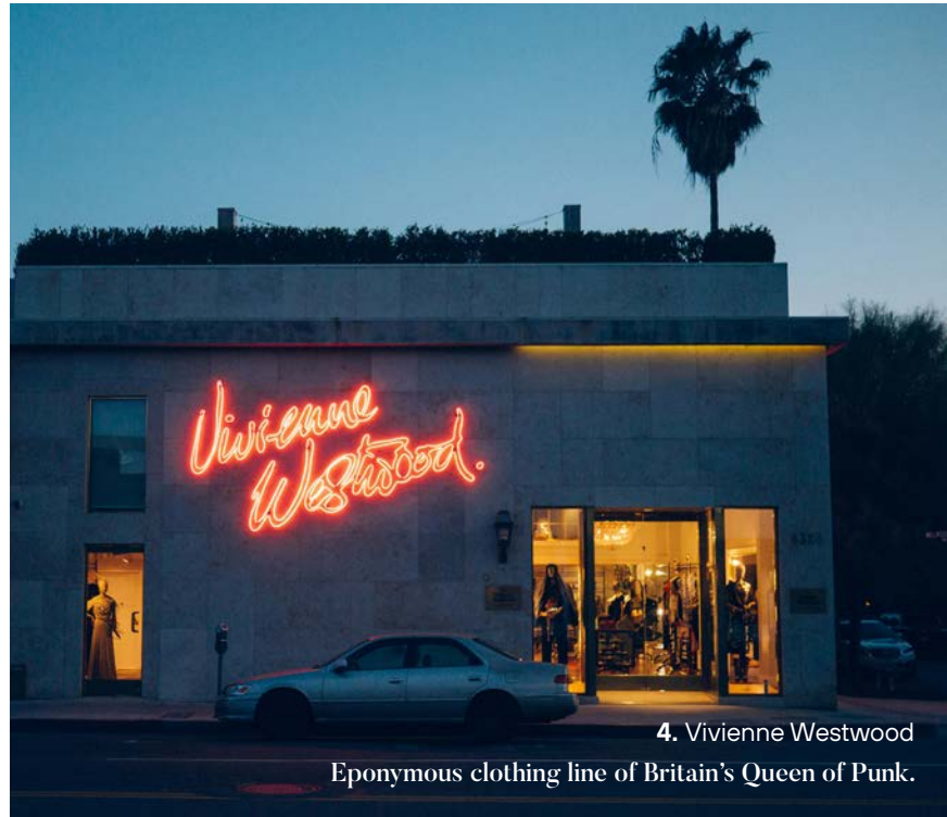
4. Vivienne Westwood Eponymous clothing line of Britain's Queen of Punk.