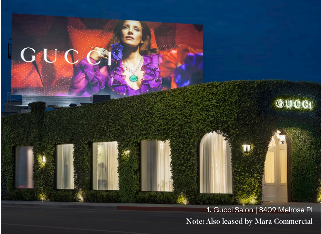
1. Gucci Salon | 8409 Melrose Pl Note: Also leased by Mara Commercial