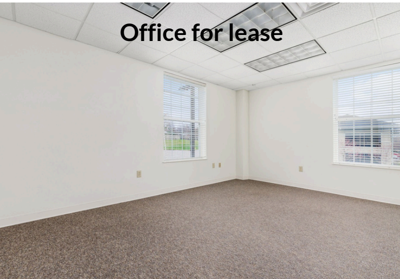
Office for lease