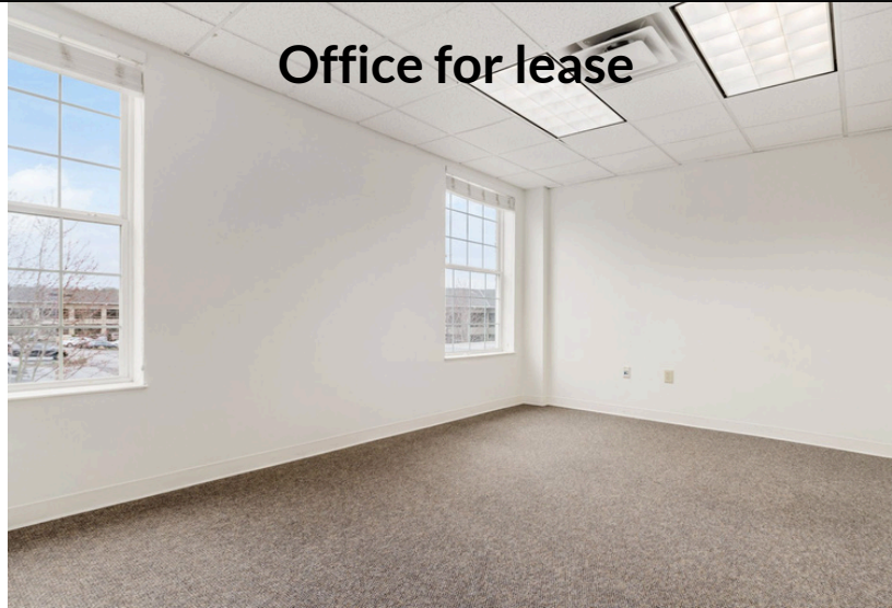
Office for lease