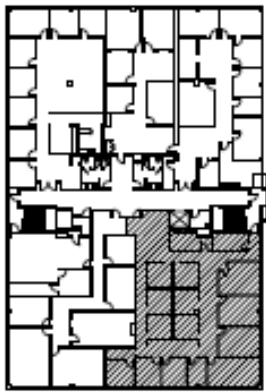
Building Key Plan