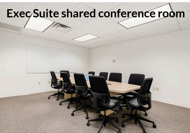
Exec Suite shared conference room