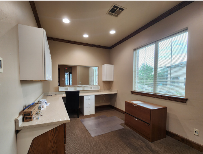
CLERICAL/ADMIN WORK AREA